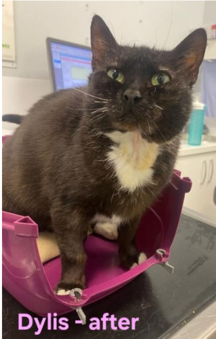
Dylis - after

Beautiful approx. 2-year-old black with white chest female mother cat that we took in pregnant with a terrible skin condition, which she has gone through an amazing transition with, and is looking so much better! Beautiful natured, friendly, loving girl. Vaccinated, flea, wormed, spayed & microchipped. Dylis will need to be a house cat only as she requires daily medication. She will be one of our long-term cats in SANCTUARY where the rescue will pay her vet costs and on-going medication.